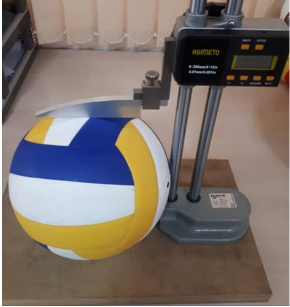
Figure 1. The caliper used to measure the diameter of sample balls

Undamaged sample balls were measured using an advanced caliper after 24 hours [16]. The measurement method was that various points of ball taken out of the impact tester were measured in 12 efforts as Figure 1 indicates.