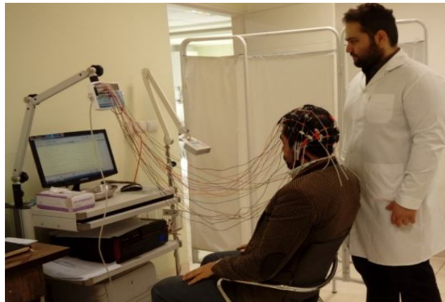
Figure 2. Recording brain waves in the resting phase

In the second stage, subjects watched advertisement video regarding Nike brand and their brain waves were recorded by the EEG device. This process was exactly done like the first process the difference was that testes were watching Nike brand advertisement (Figure 3).