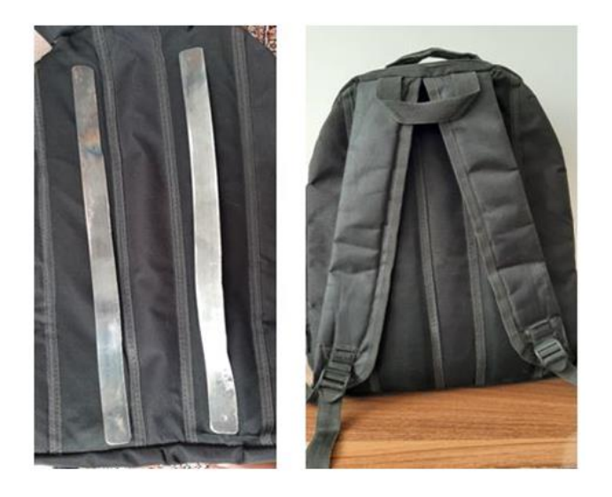
Figure 1. The bars embedded in the backpack make it look like a bracelet.

To design a bag with the ability of a brace, we have made a bag by restraining the parts of the spine in the thoracic-lambo-sacral region (Figure 1). Its unique design creates a good distribution of pressure on the shoulder that is suitable for all ages, and has two metals to maintain the natural alignment of the spine and adjustable arms in the front of the trunk and front of the abdomen.