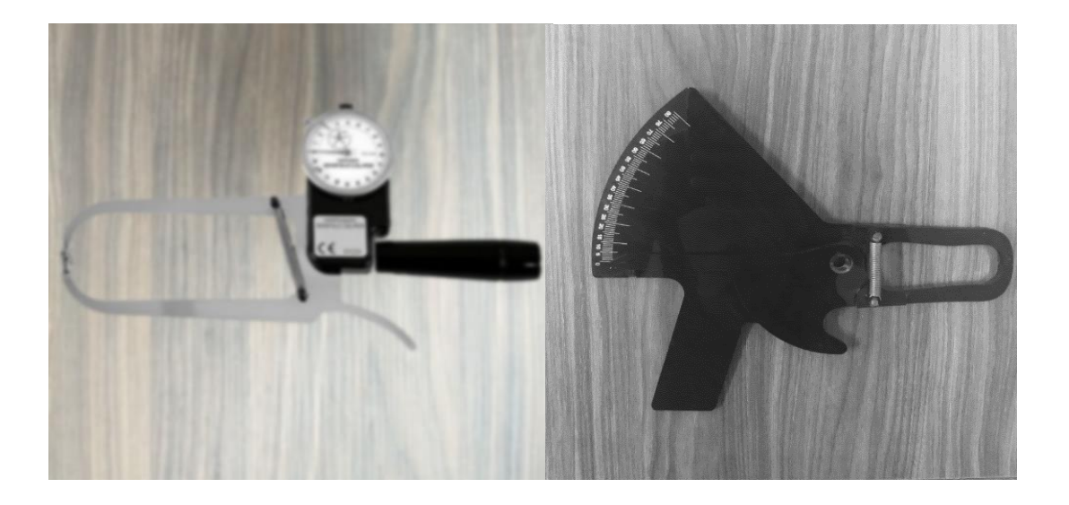
Fig. 2. Iranian slim guide caliper vs Harpenden caliper