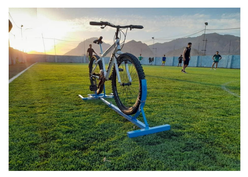
Figure 3. Overview of the stand rollick device

easily adjusted in any place and any mobile bicycle can be placed on it. In addition, different parts of the device can be separated and transferred to any place and used (Figure 3).