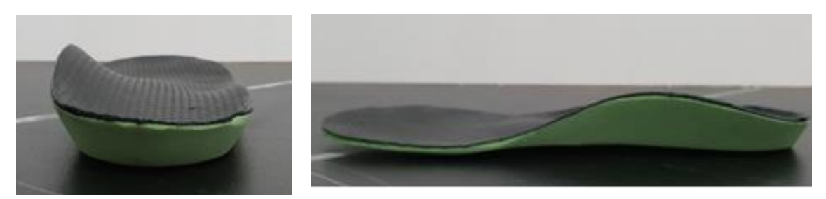
Fig 2. Medial and posterior views of insole