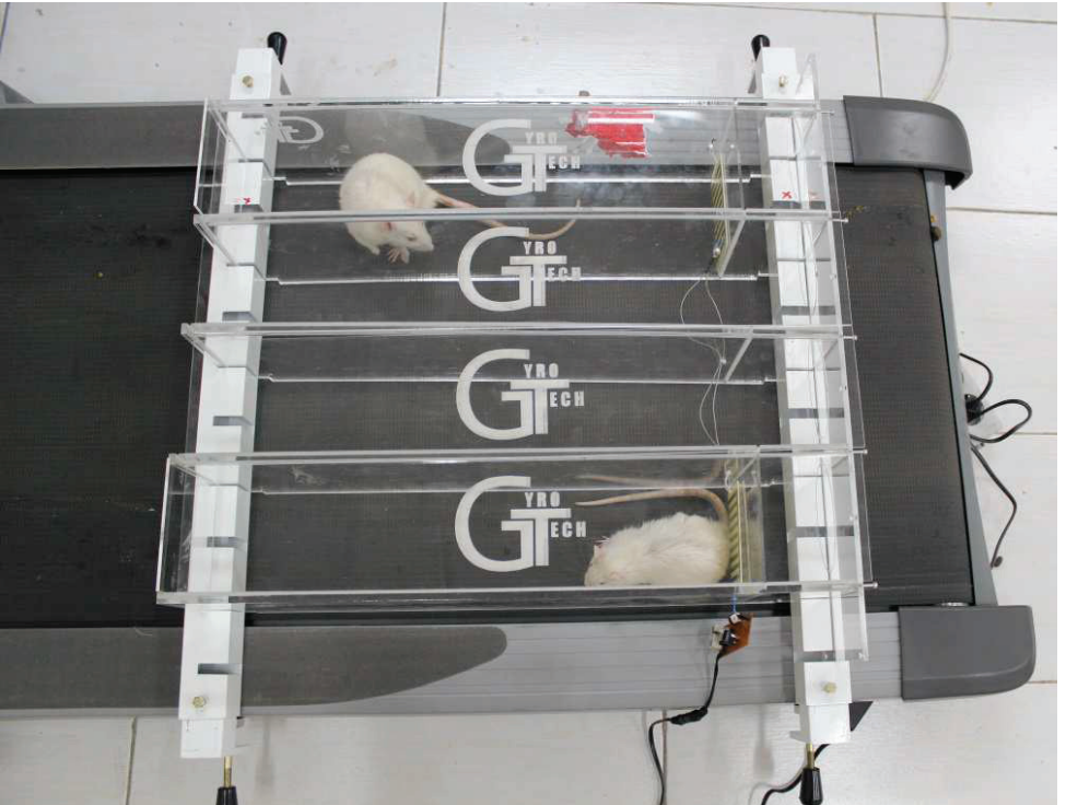
Figure 2. The mouse treadmill compartment on a human treadmill.

To this end, aluminum profiles, which were chosen after calculation of machining, were used.