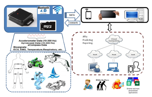
Figure 1. Data logger and its applications.

The backbone of the system was Wi-Fi communication between each data logger with the server. For this purpose ESP8266 was used and programmed as a client to communicate with a web server. To enable this data logger to apply as a wearable device, a Lithium polymer battery (3.7 v, 440 mAh) was implemented and a battery charger chip was used to supervise the battery voltage and charging. A high-efficiency step-up DC-DC converter was mounted on the board to regulate the battery voltage at 3.3 v. The ESP8266 has no flash memory, therefore a 32 Mbit flash memory implemented in this data logger and a MicroSD card socket was mounted and connected to ESP8266 SPI port for offline data storage in FAT32 format on a 2GB MicroSD card.