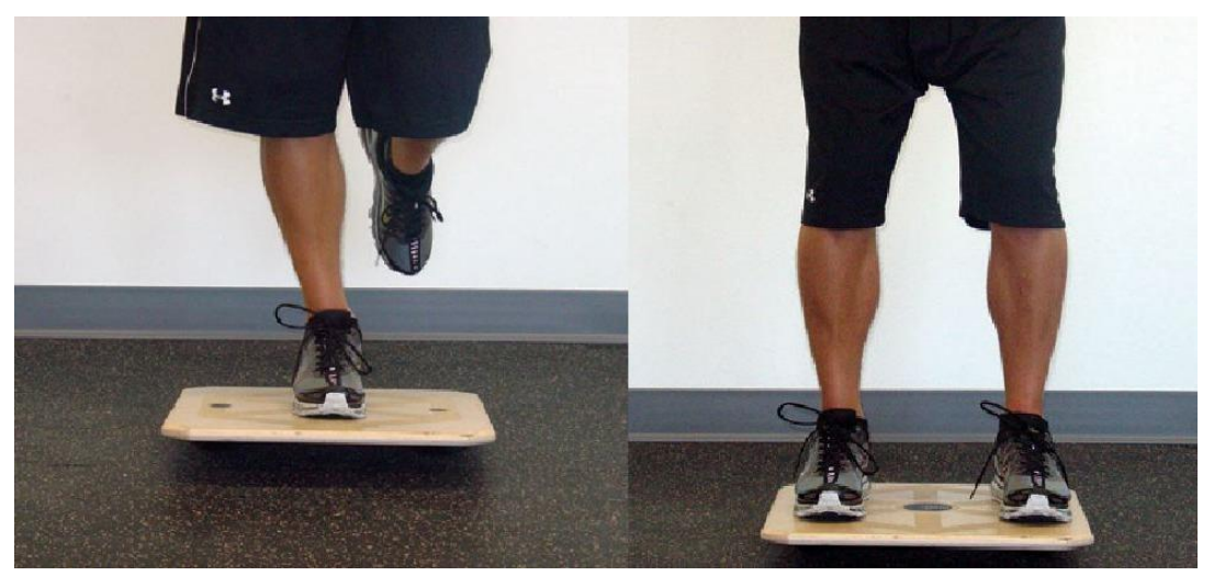
Figure 3. Participants performing the wobble board exercises

This exercise was performed in one session. To enhance the generalizability of the results, all four groups were warmed up (including standard warm-up program, generally and specifically) for 15 minutes before the interventions and training (Table 1) (4,7). Five exercises were performed using a wobble board with the dimensions of 40 by 40 cm and a height of 10 cm as follows (Fig. 3).