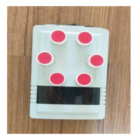
Figure 3: The screen with 6 lamps on it

2. Lamps panel: The screen has 6 lamps on it (one lamp for each sensor) and after each test shows the reaction time of the player (Figure 3).