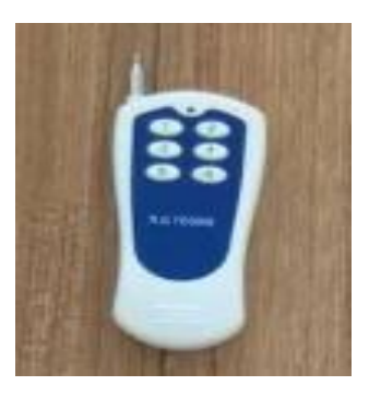
Figure 4: The remote for turning on the panel lamps

3. Remote: A device that commands to turn on the panel lamps. Due to the physical condition of the coaches and athletes of sitting volleyball, the remote is wireless (Figure 4).