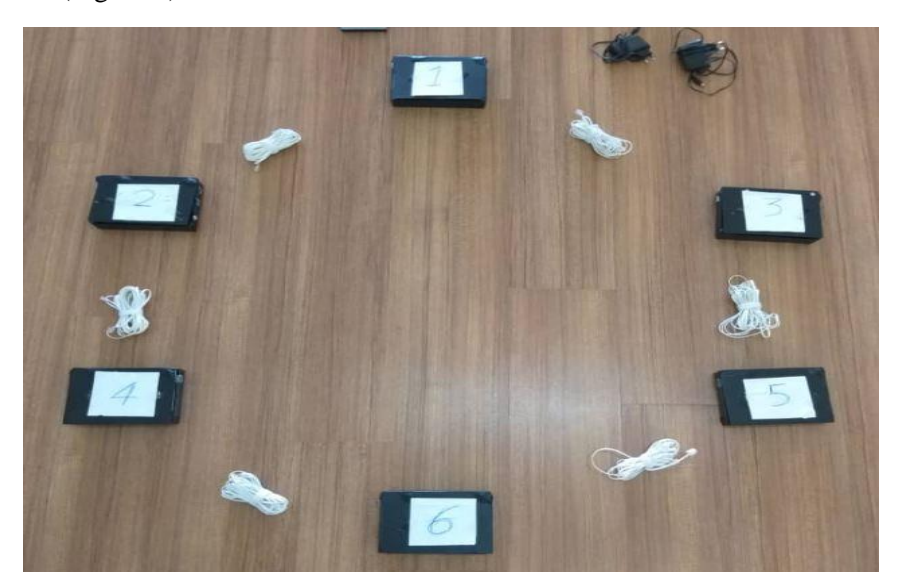
Figure 2: 6 touch sensitive sensors

1. The sensors: 6 touch sensitive sensors (20×10×5 cm) that are placed around the player on the floor and create a hexagon. These sensors are connected to each other and to the lamp panel via wires (Figure 2).