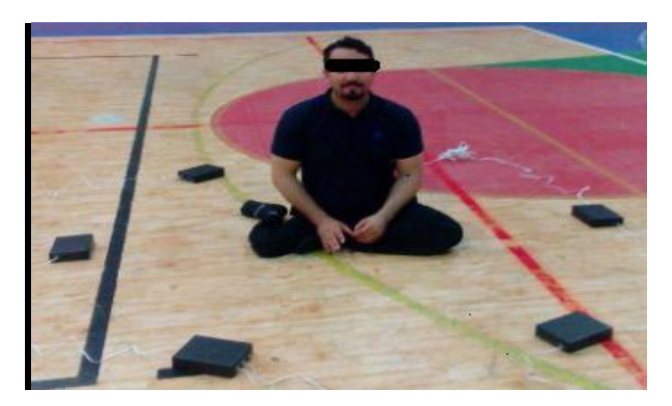
Figure 1: Complete design and setting of the device

The device consists of three electronic parts connected to each other, which include: The sensors, Lamps panel and the Remote.